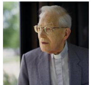
J.I. Packer, Professor of Theology at Regent College